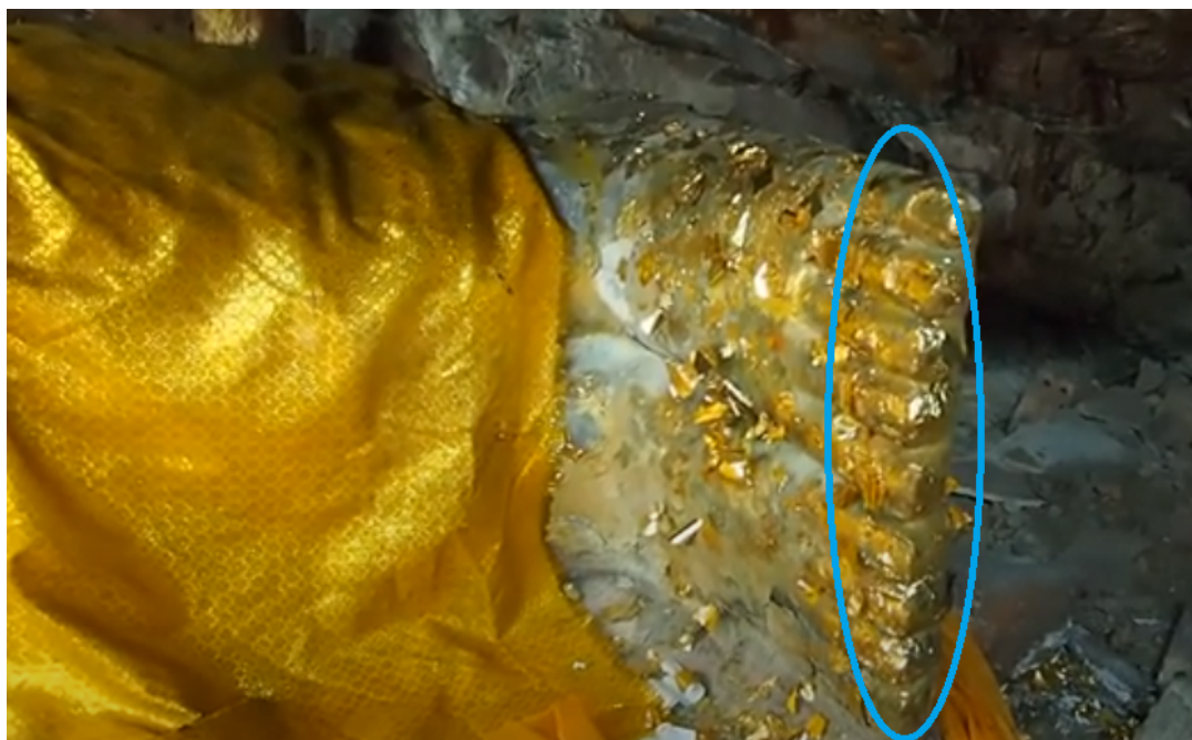
A. At Wat Kao Yi Sarn

This temple is at Nonthaburi province. This main Buddha image of the temple has only 9 fingers and locally name Lang Pho Kao (Kao is a local language mean nine). The left hand of the Buddha image has only 4 fingers.