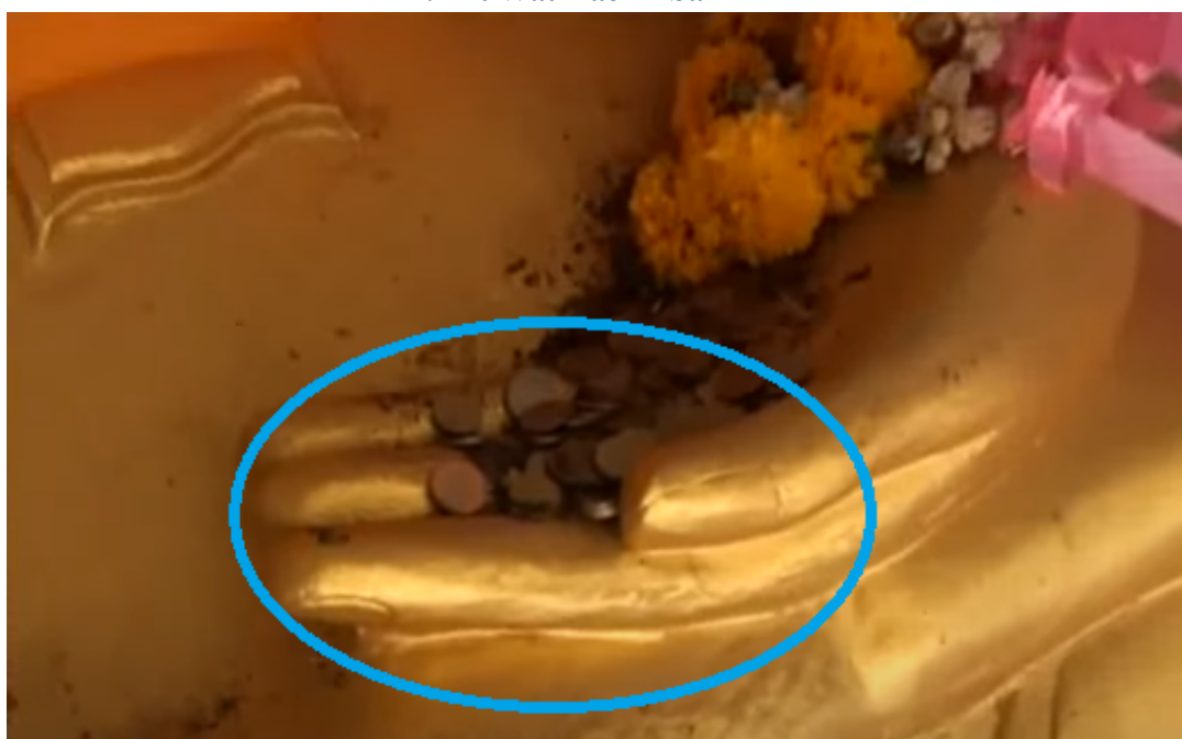
B. At Wat Kao Niew